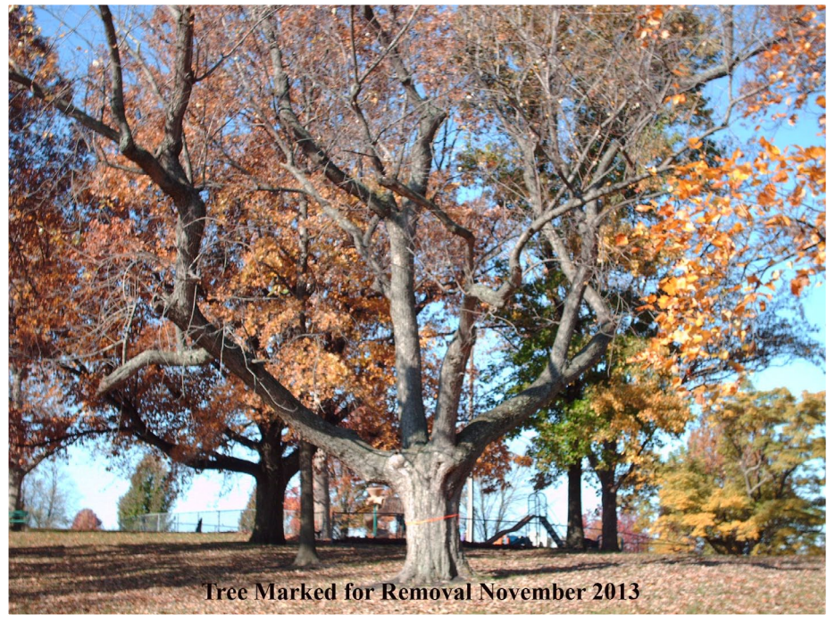
Tree Marked for Removal November 2013

A group of staff organized itself as a “Notre Dame Arboretum Committee” to address the reality of trees on campus having died or being under stress. Several instances of high winds took their toll on trees that had been weakened by summers of drought and unusual winter ice storms. In addition, as elsewhere in the area, particular species were under attack by the elm leaf beetle and the ash borer. Trees likewise had to be sacrificed to the construction projects of the last two decades. The committee began discussions of how to “reforest” the campus. The discussion expanded to the entire Dixie Highway property when it was noted that many dead or dying trees were being removed from the Sisters of Notre Dame’s St. Joseph Heights property.